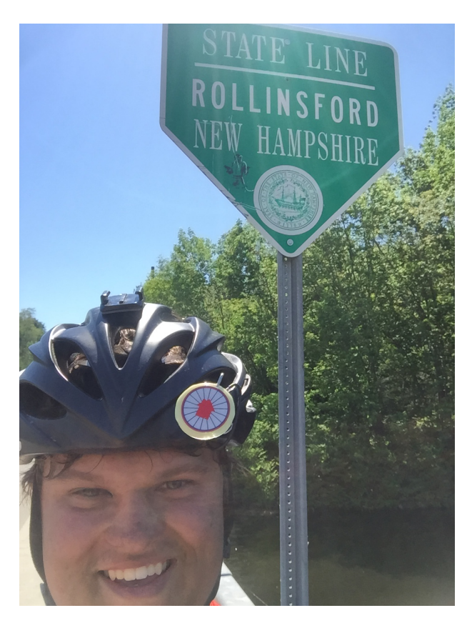
Crossing my first state line into New Hampshire!