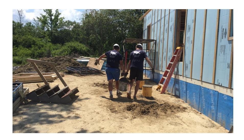
Working on a project in Portland, Maine