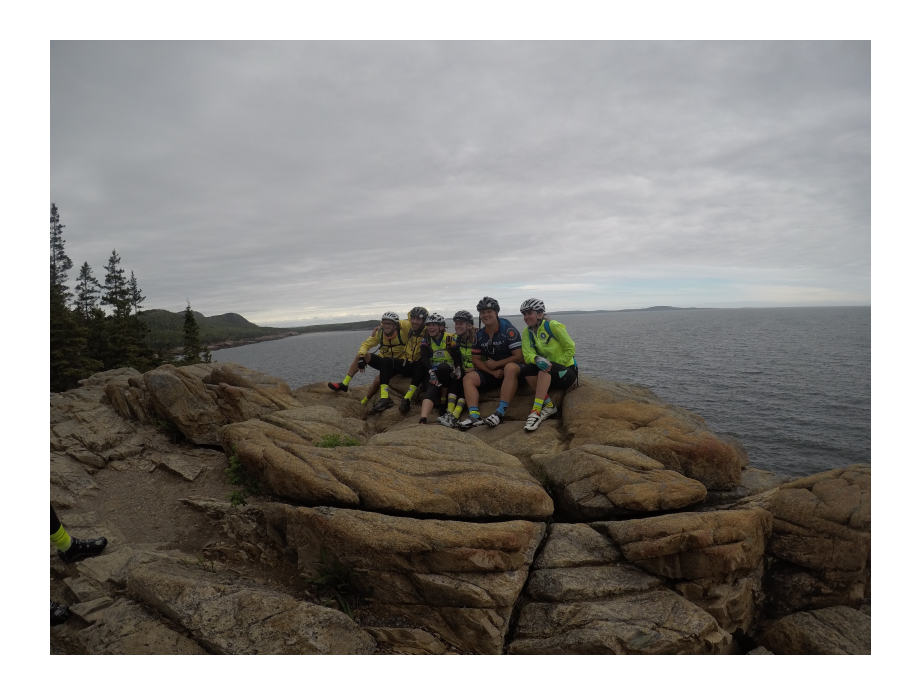
Teammates and I in Acadia National Forest, Bar Harbor, Maine