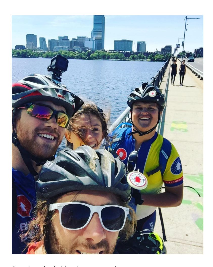
Crossing the bridge into Boston!